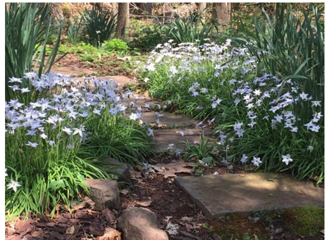
Wisley Blue Ipheion on a shaded path

Spring is such a wonderful time of year for all of us, as well as for the plants and flowers in our region. The days are not too hot, rain seems plentiful, and new growth springs forth from the brown, barren ground. Plants and grasses seem so lush—so many different shades of green to spy and each so vibrant. As you walk through your neighborhood, take some time to smell the flowers or at least look up into the trees to see the greenery and down to see what's peeking out in your neighbors' yards or common areas—and it doesn't require getting your own hands dirty.